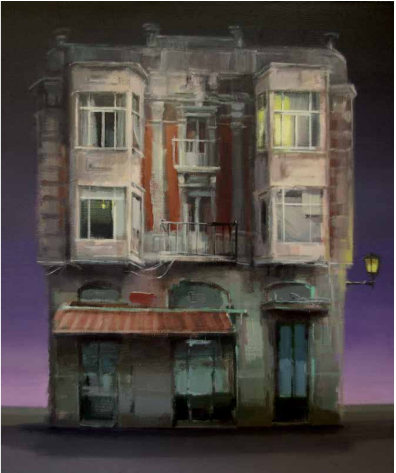
LETICIA GASPAR, ST , 2016. Acrylic on canvas. 64 x 54 cm