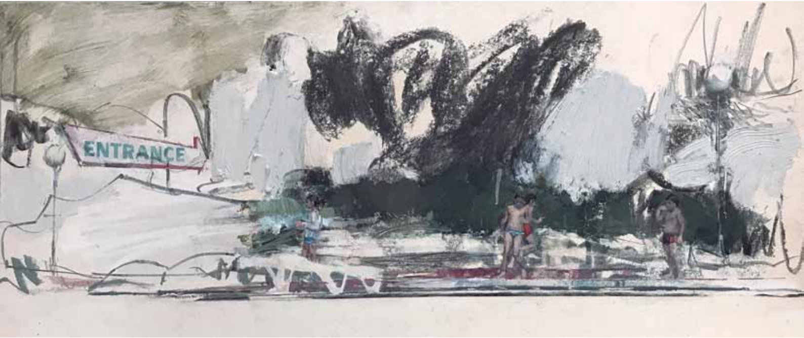
MARTA LAFUENTE, 2018. Tiny Lives. Scene 1 . Mixed media on cardboard glued to board. 32 x 75 cm