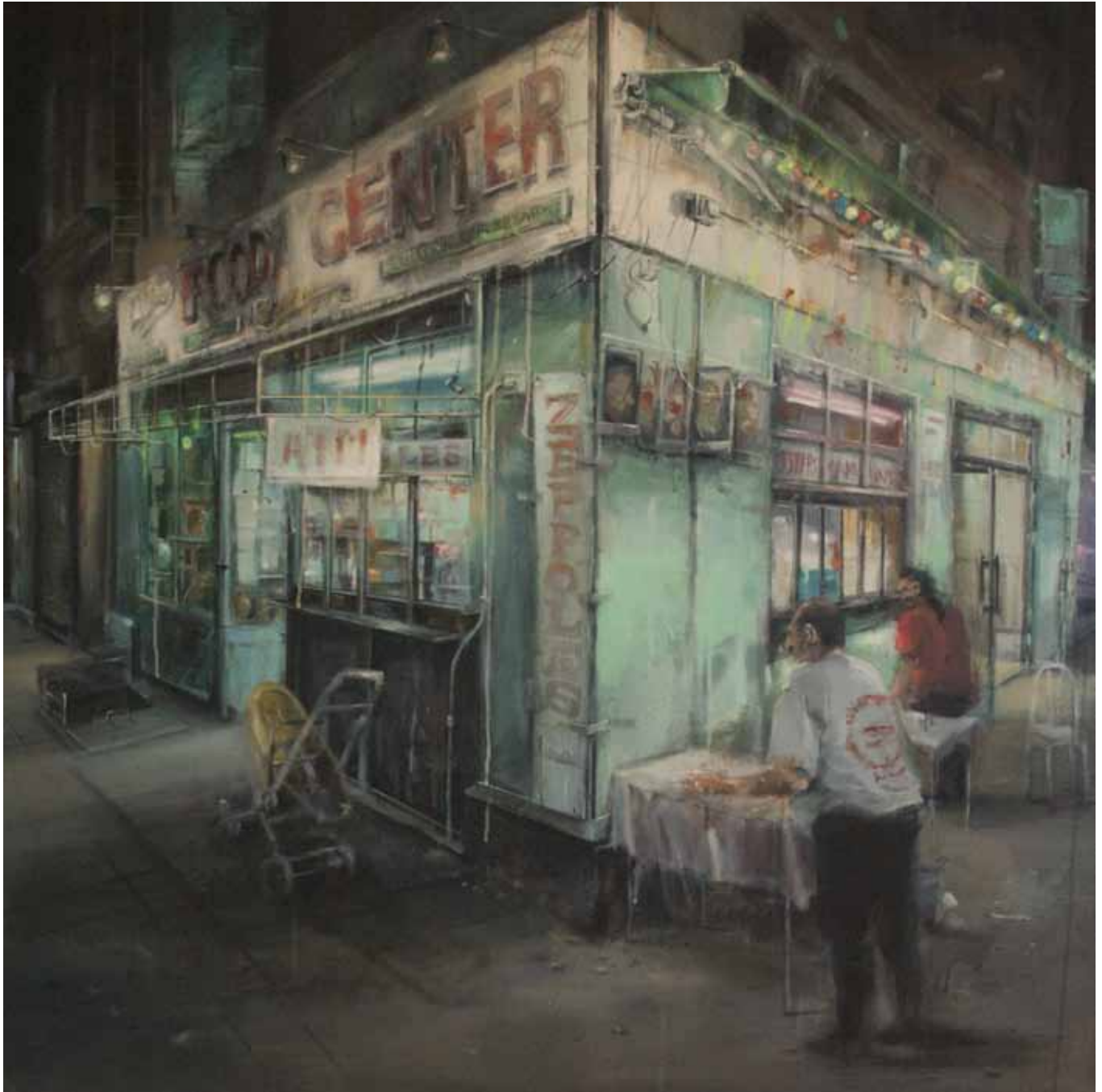
LETICIA GASPAR, Fast living , 2016. Acrylic on canvas. 120 x 120 cm