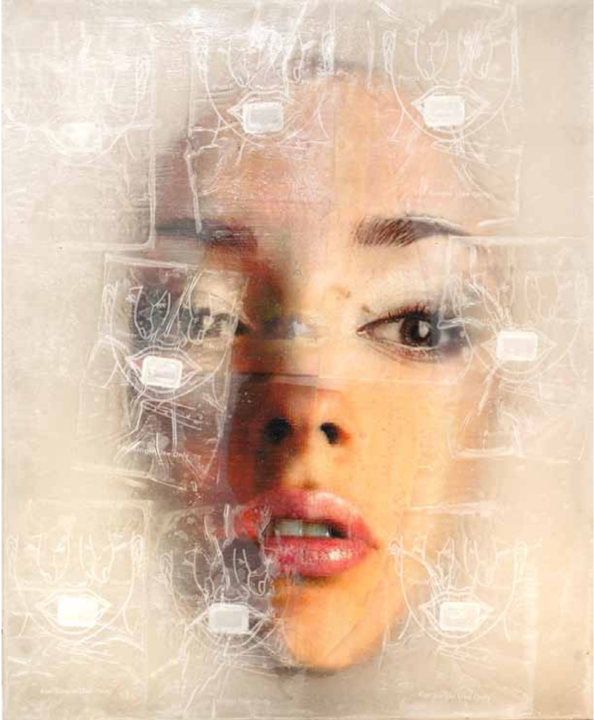
LIU GUANGYUN, Serie Surfaces , 2011. Mixed media. 100 x 80 x 15 cm