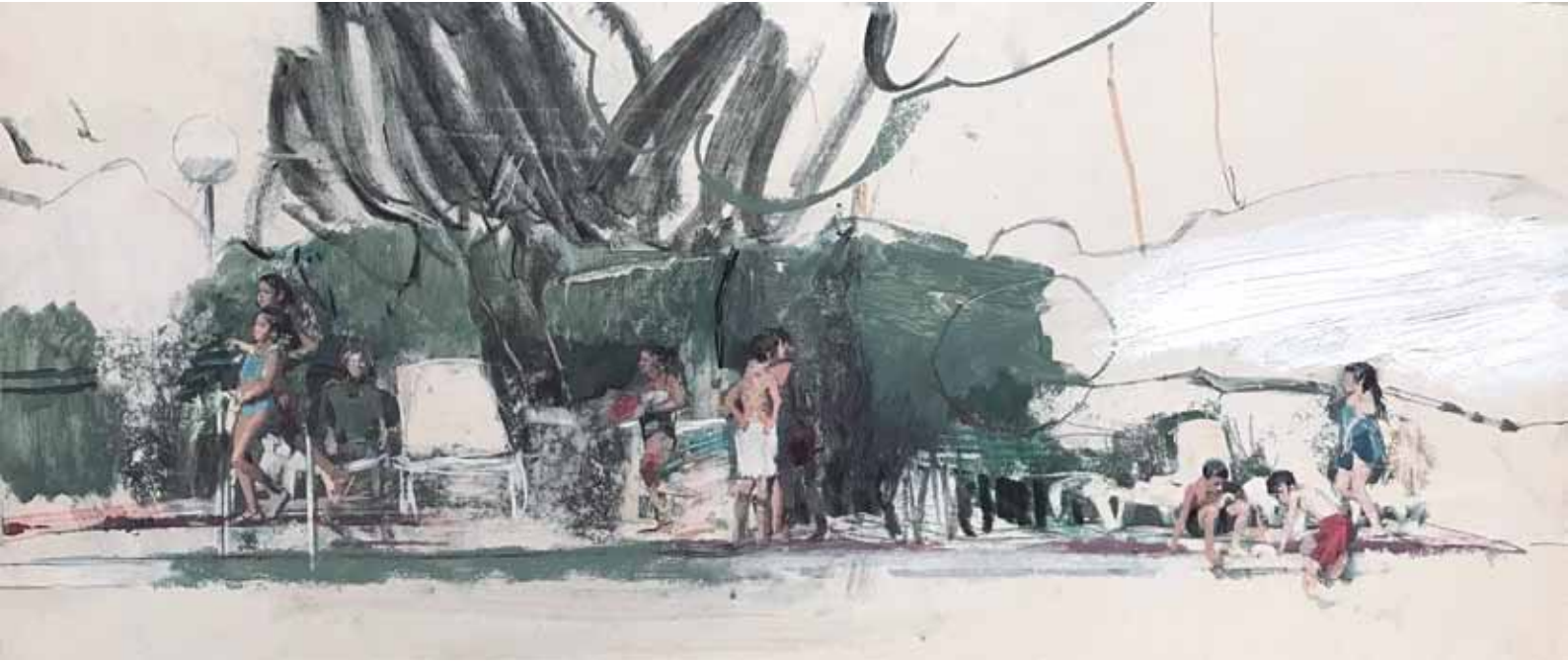
MARTA LAFUENTE, 2018. Tiny Lives. Scene 3 . Mixed media on cardboard glued to board. 32 x 75 cm