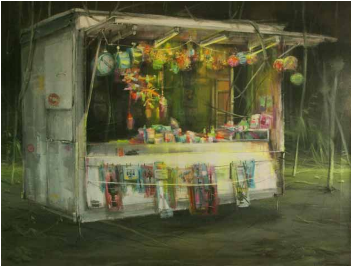
LETICIA GASPAR, Ilusión , 2016. Acrylic on canvas. 100 x 130 cm