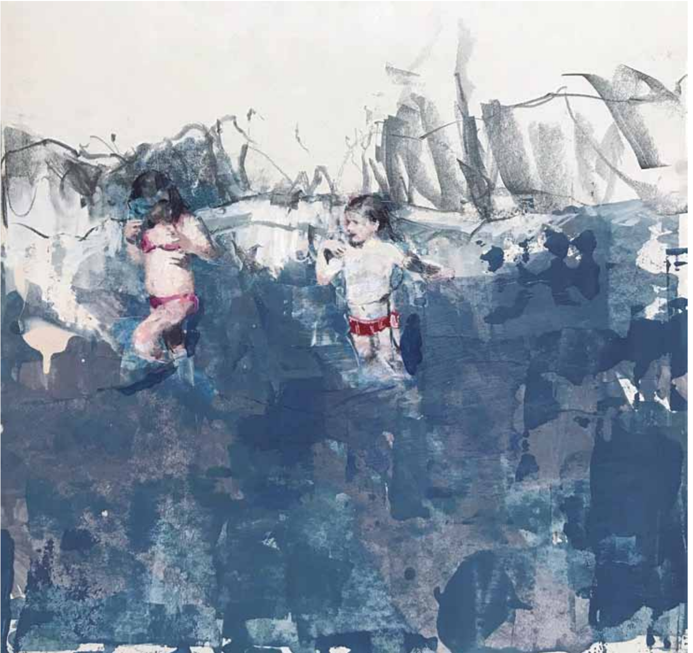
MARTA LAFUENTE, 2018. Tiny Lives. Scene 4 . Mixed media on cardboard glued to board. 44 x 44 cm