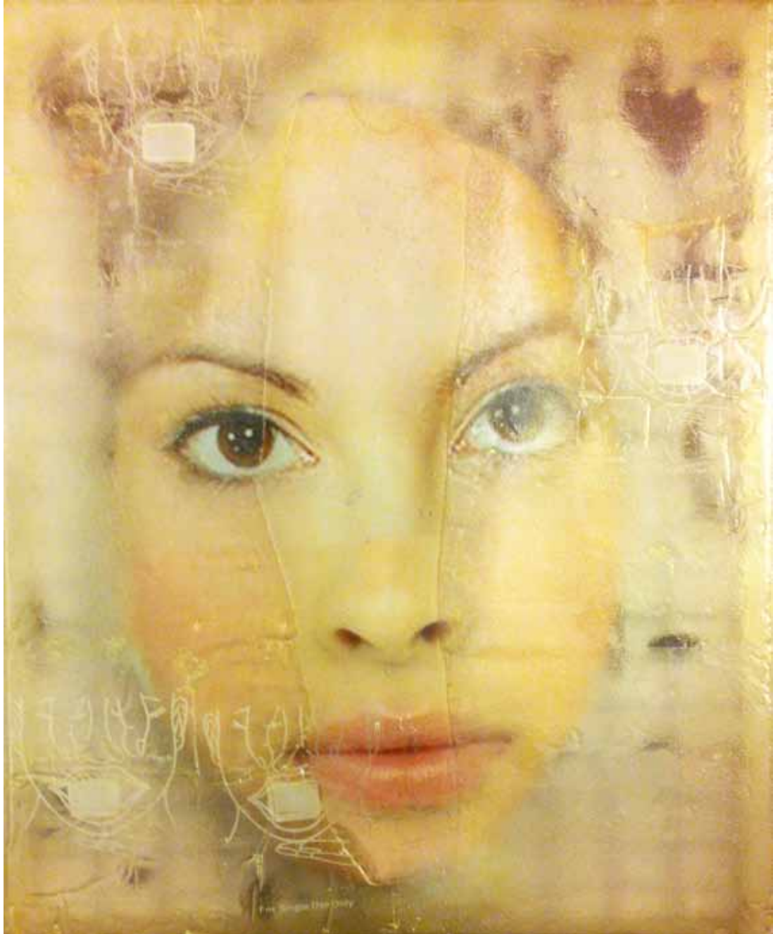
LIU GUANGYUN, Serie Surfaces , 2011. Mixed media. 100 x 80 x 15 cm